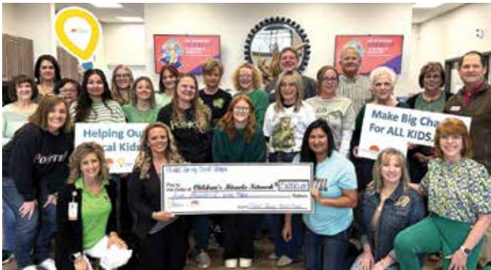
Postel Family Credit Union

When our community comes together, incredible things happen for our tiniest patients.