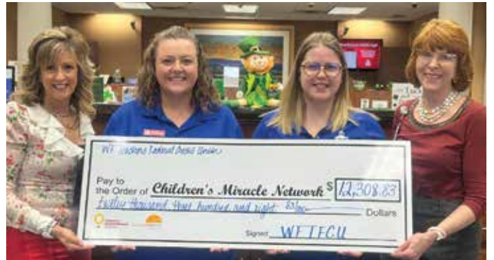
Wichita Falls Teachers Federal Credit Union