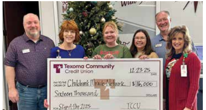
Texoma Community Credit Union