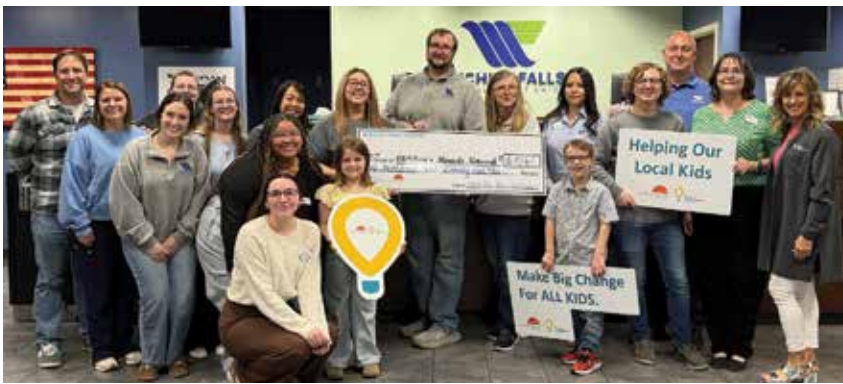
Wichita Falls Federal Credit Union

We are deeply grateful for the amazing support from our community in helping care for our tiny babies, kids, and families.