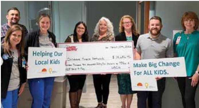
Union Square Credit Union