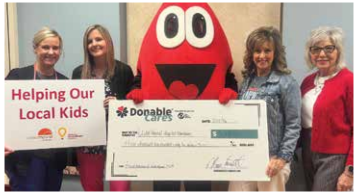
Our Blood Institute